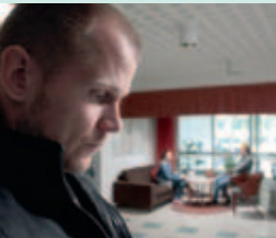
All Hallows' Week

The Finnish Film Foundation Martin-Gropius Bau | Scandinavian Stand 28 www.ses.fi