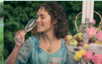
Where Once We Walked