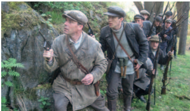
Dead or Alive 1918

Pasilan Vanhat Veturitallit, FI-00520 Helsinki Tel. +358 9 6850 460, Fax +358 9 6850 4610 email kino@kinoproduction.fi