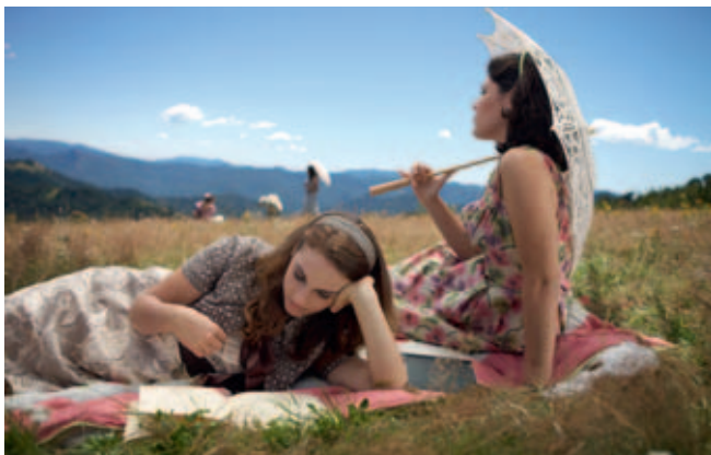
The Italian Key