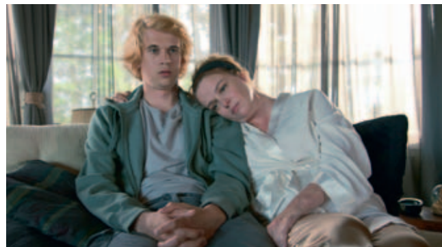
The Good Son

The New Artist (in pre-production | documentary)