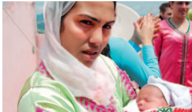
Dance of Outlaws

Virtual War (2012 | 58') Leap (2012 | 81') Dance of Outlaws (2012 | 80'/52') Dreams Deferred (2012 | 107') Fault Lines (in production / development) Eco Valley (in production / development | 50') Lordi (in production / development | 85') Wonderworld of Ice (in production / development 50')