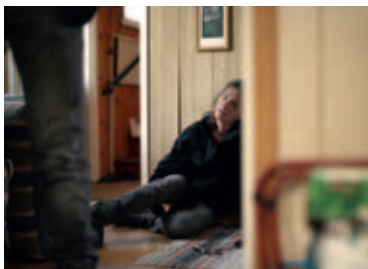
Hush – Anything for Love

Vanha talvitie 11 A, 4. krs, FI-00580 Helsinki, Tel. +358 9 7740 300